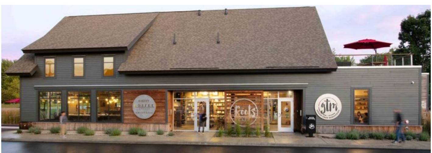
Modern Retail Design with Low Profile & Use of Earth-Tone Colors