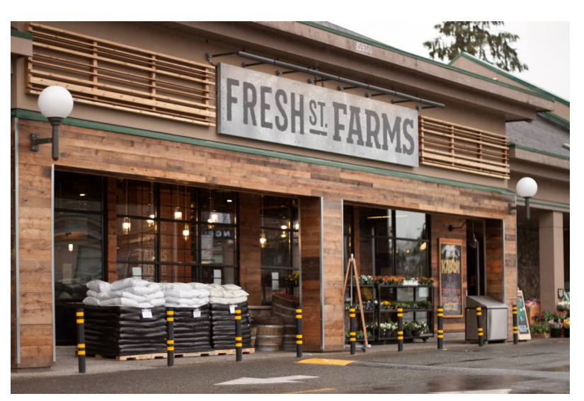
Exposed Wood and Attractive Architecture Elements