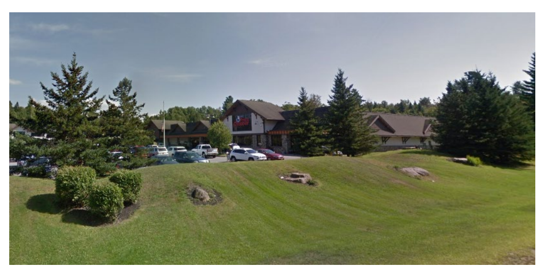
Use of Earth-Tone Colors and Vegetative Berm

Town of Prattsville Site Plan Review Law