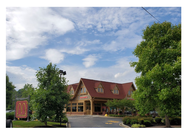
Alternative Franchise Architecture